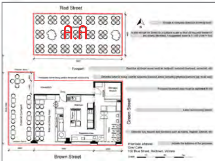
Red Line Plan