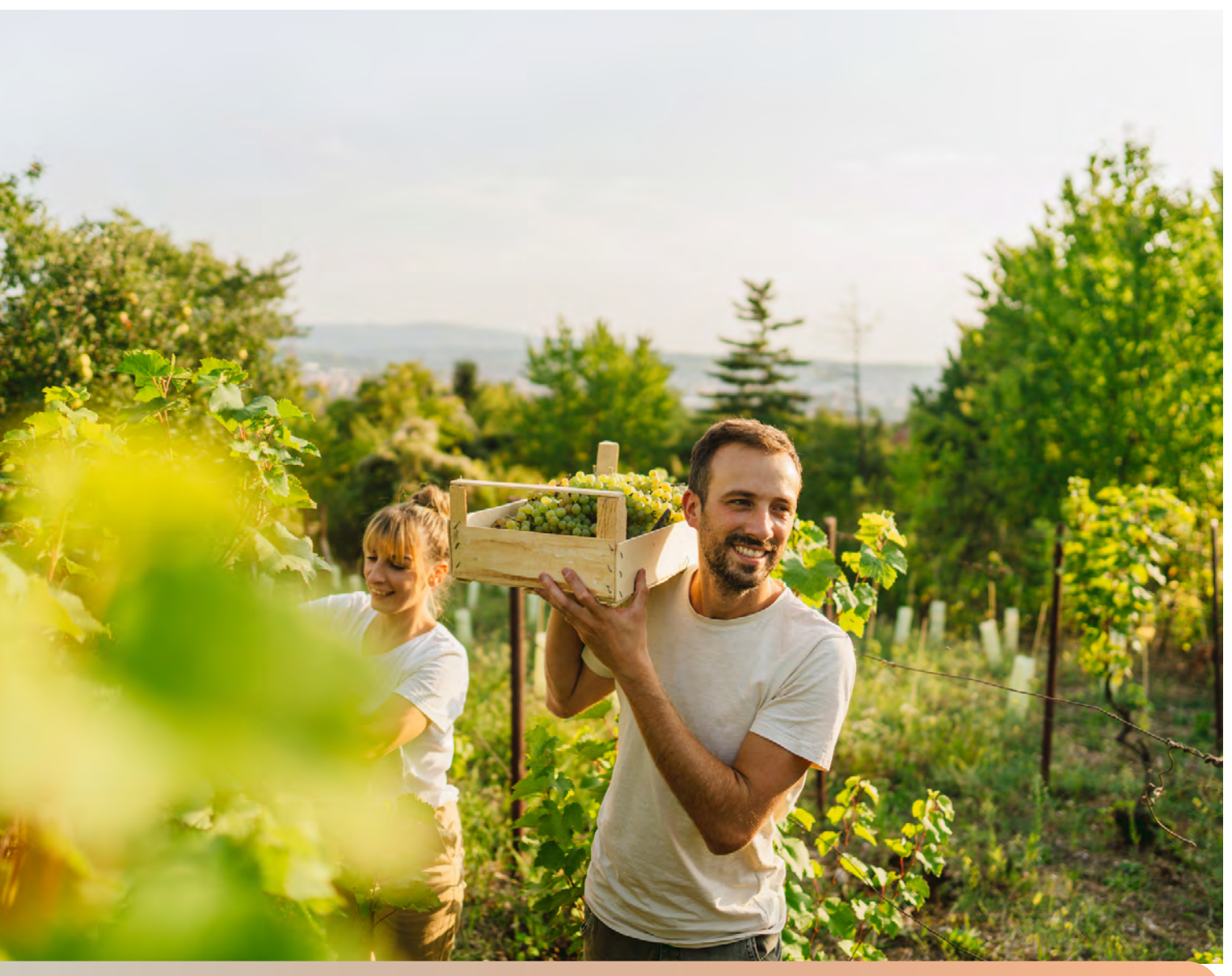
Liquor Licensing & Food Registration | Types of Liquor Licence