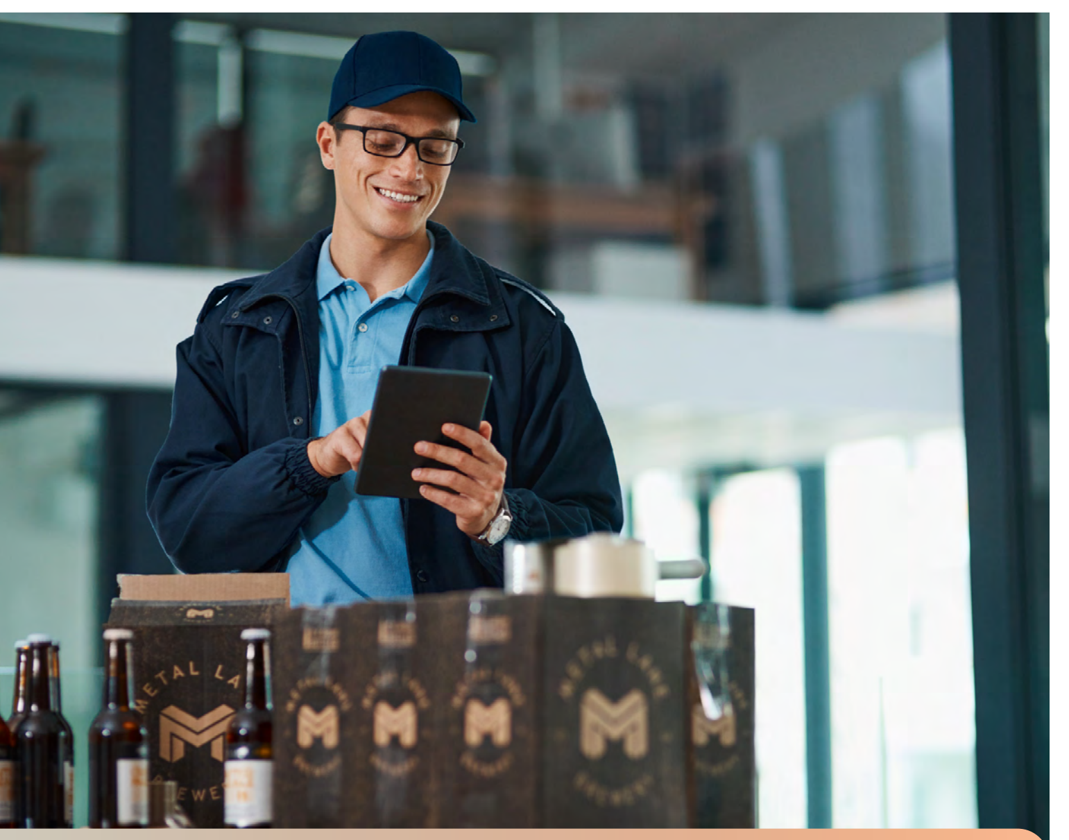
Liquor Licensing & Food Registration | Types of Liquor Licence

No, a planning permit is not required as there is no licensed premises attached to the licence. Sales are not permitted to the public.