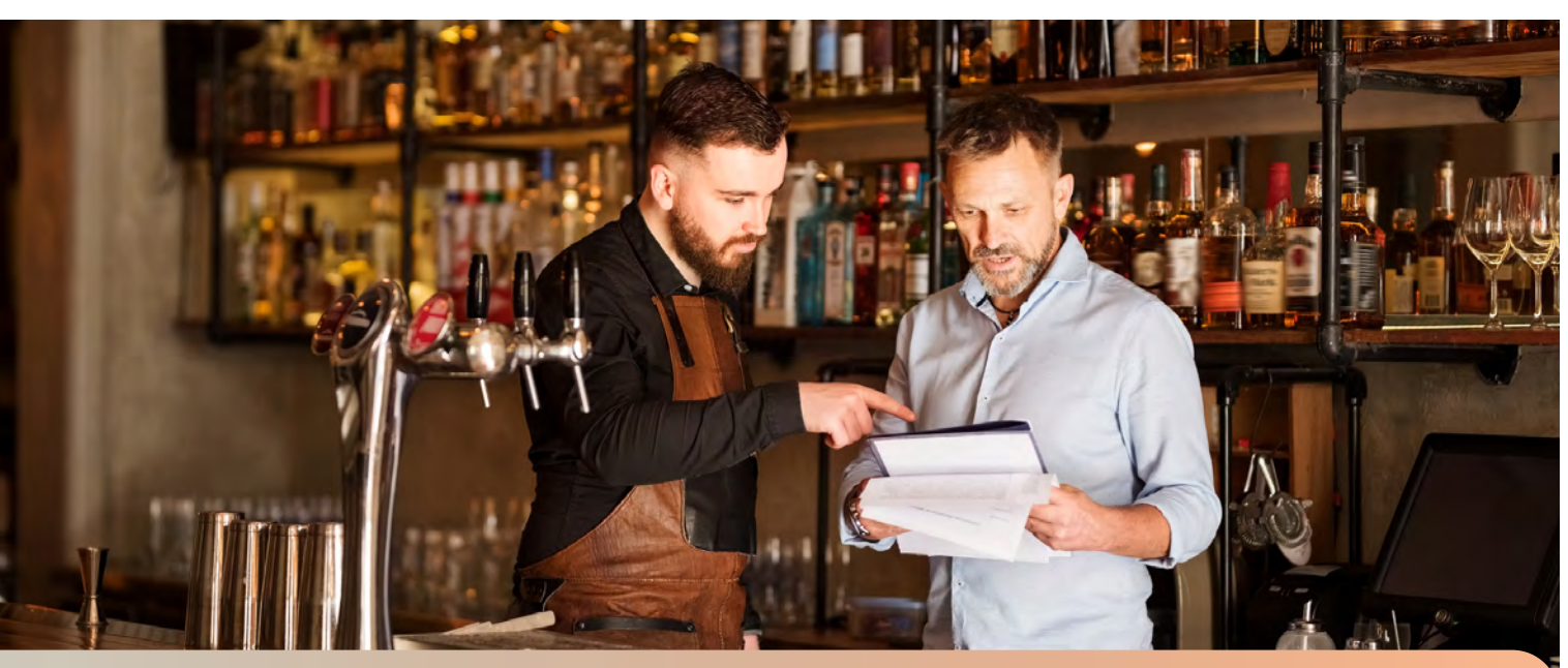
Liquor Licensing & Food Registration | Types of Liquor Licence

*The Cities of Melbourne, Darebin and Port Phillip have some exemptions. Please contact these Council areas to confirm.