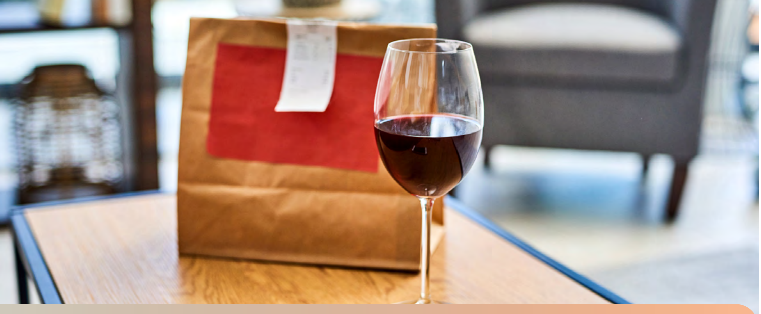
Liquor Licensing & Food Registration | Types of Liquor Licence

There are no set trading hours for these licences. You should specify the hours you desire when applying.